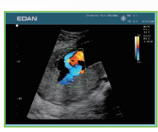
Hemodynamic information is clearly seen in this second trimester umbilical cord.