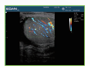
High frequency imaging provides the sensitivity necessary to display normal testicular flow.

From superb image quality to the streamlined user interface, the U50 Prime Edition ultrasound system is designed to give you more diagnostic information across target applications than similarly priced competitive systems. Advanced 2D and color Doppler imaging technologies you'd expect to find only in premium-priced systems are standard. The portable U50 Prime Edition system delivers the performance of a high-end system at a compact price.