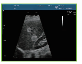
Spatial compounding and speckle reduction enhance contrast resolution to clearly delineate hepatic lesions.