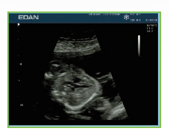
Evaluation of the fetal heart demands exquisite detail resolution.