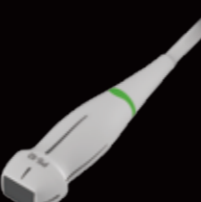
1-5 MHz Phased Array