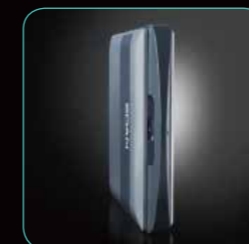
Sleek compact design fits into any environment