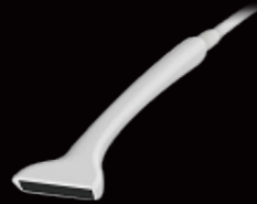
7 - 17 MHz High Frequency Compact Linear Array