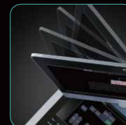
Tilt-and-swivel monitor for optimal viewing