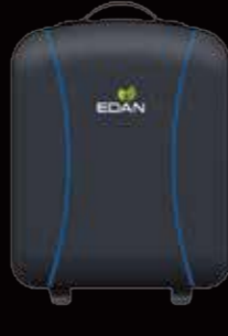
Sturdy, versatile travel case