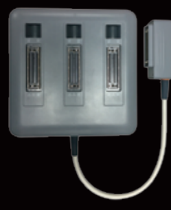
Multi-transducer connector option