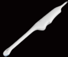
4 - 8 MHz Endocavity Curved Array