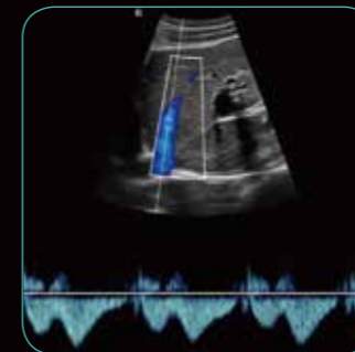
The C5-2Q transducer delivers exceptional color and spectral Doppler sensitivity visualizing the left hepatic vein.