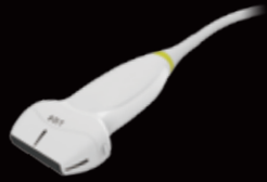
5 - 12 MHz Linear Array