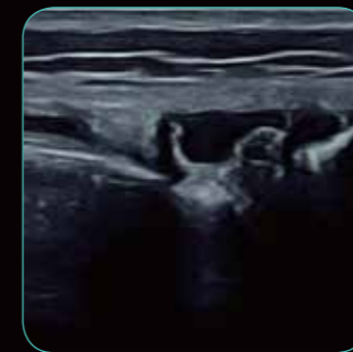
This fluid collection on the anterolateral aspect of the knee is clearly defined with the L12-5Q transducer.