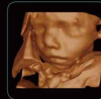
The 3D/4D feature enables fast and easy acquisition for outstanding fetal face detail.