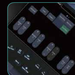
Customizable control panel to personalize your user interface