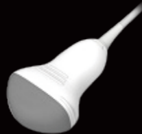
2 - 5 MHz 3D/4D Mechanical Curved Array