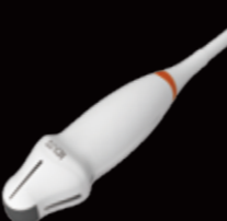
3 - 9 MHz Micro Convex Array