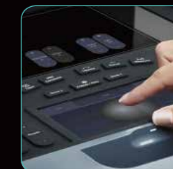
Completely sealed control panel to simplify clean-up